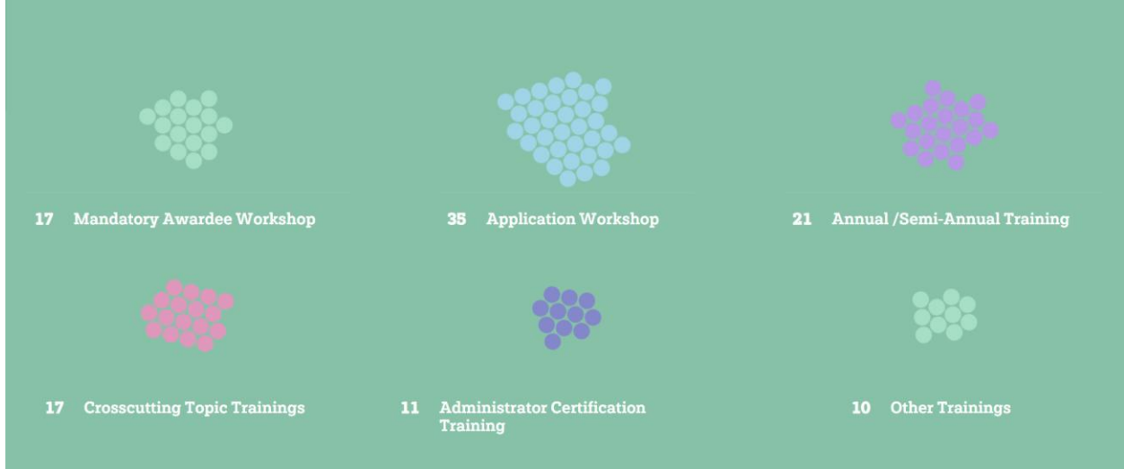
What type of live training do you provide Grantees?