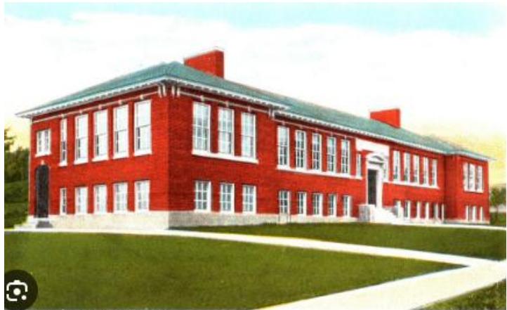
ROOSEVELT SCHOOL, KEENE, N. H.

Following its closure as an elementary school, it was leased or used for a variety of purposes until it was purchased by the Community College System of New Hampshire (CCSNH) in 2009.