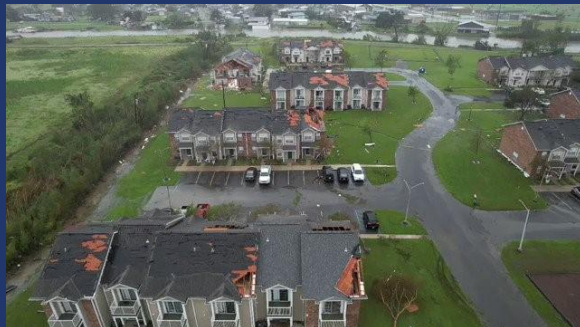
Still shot of drone footage shows a damaged apartment building less than .5 mile from Les Maisons.