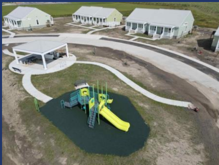
Aerial photo taken days after Hurricane Ida.

Housing units withstood Hurricane Ida with minimal damage.