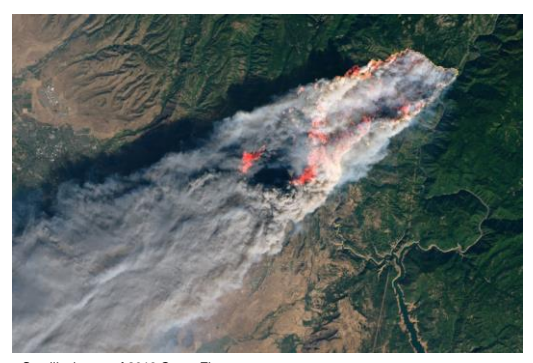
Satellite image of 2018 Camp Fire