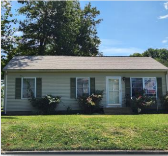
318 Salmon Ave Group Home

Here are 4 samples of 7 Group Homes assisted with HOME Funds.