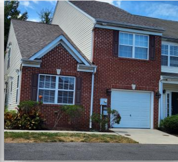
904 Leontyne Pl Group Home