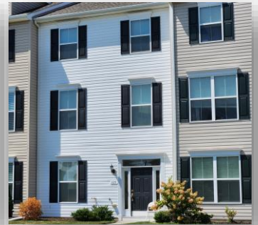
323 Ashby Commons Dr Group Home