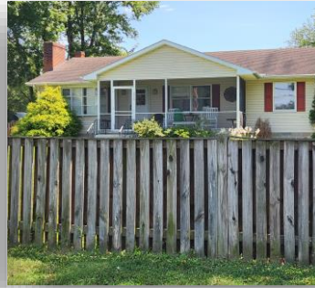
516 Washington St Group Home