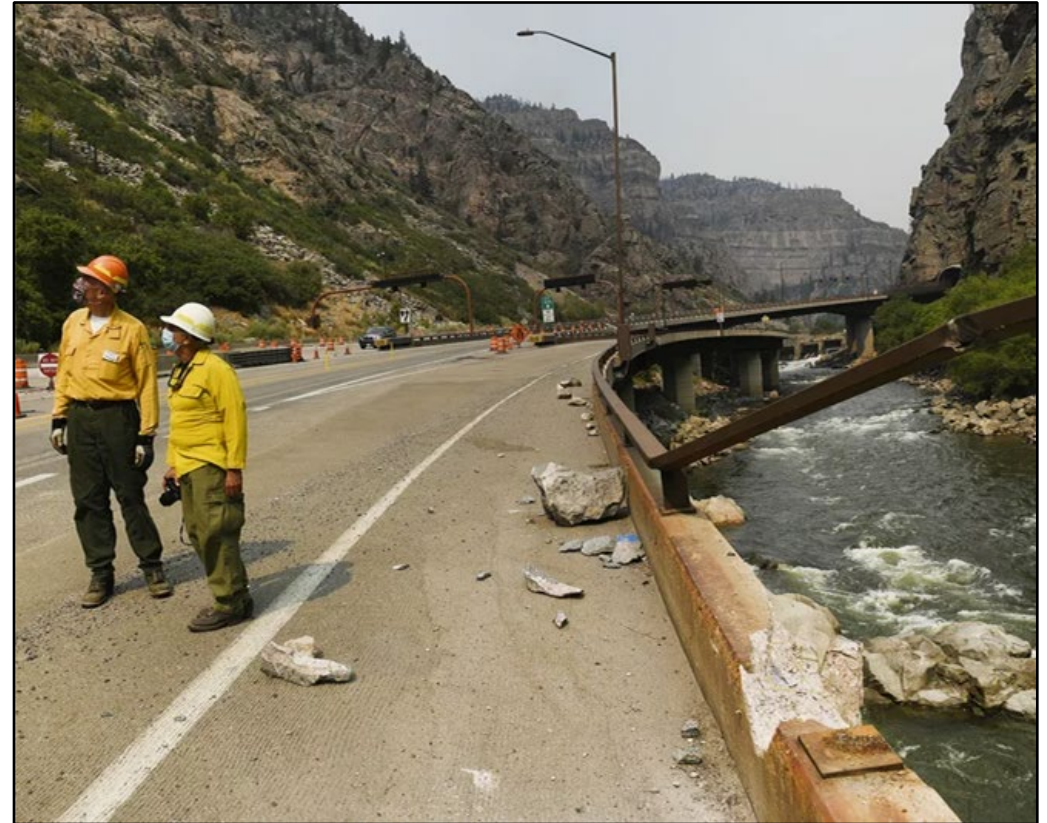
Grizzly Creek Fire along I-70 in Glenwood Canyon September 2020