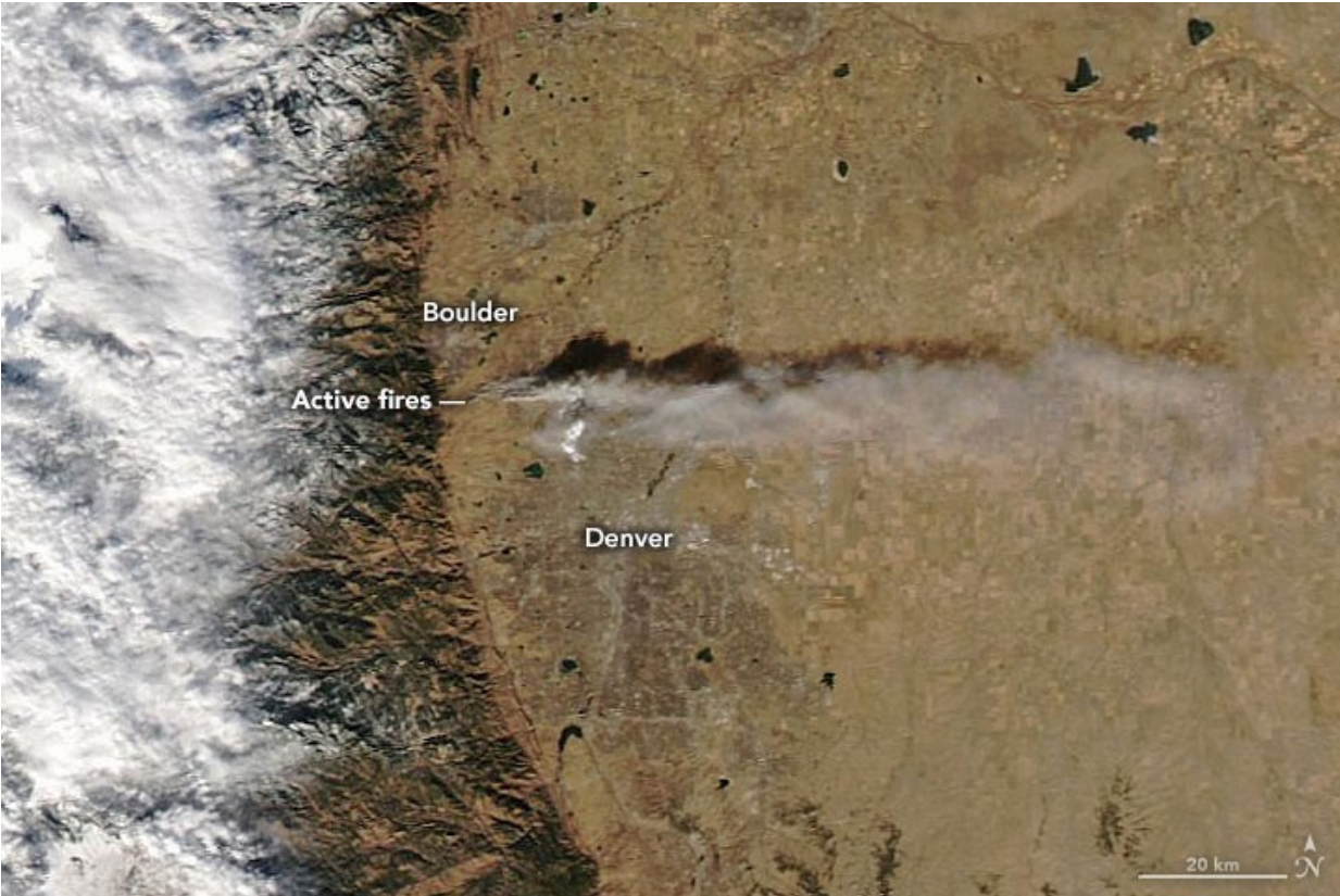
2020 Colorado Wildfires August 2020