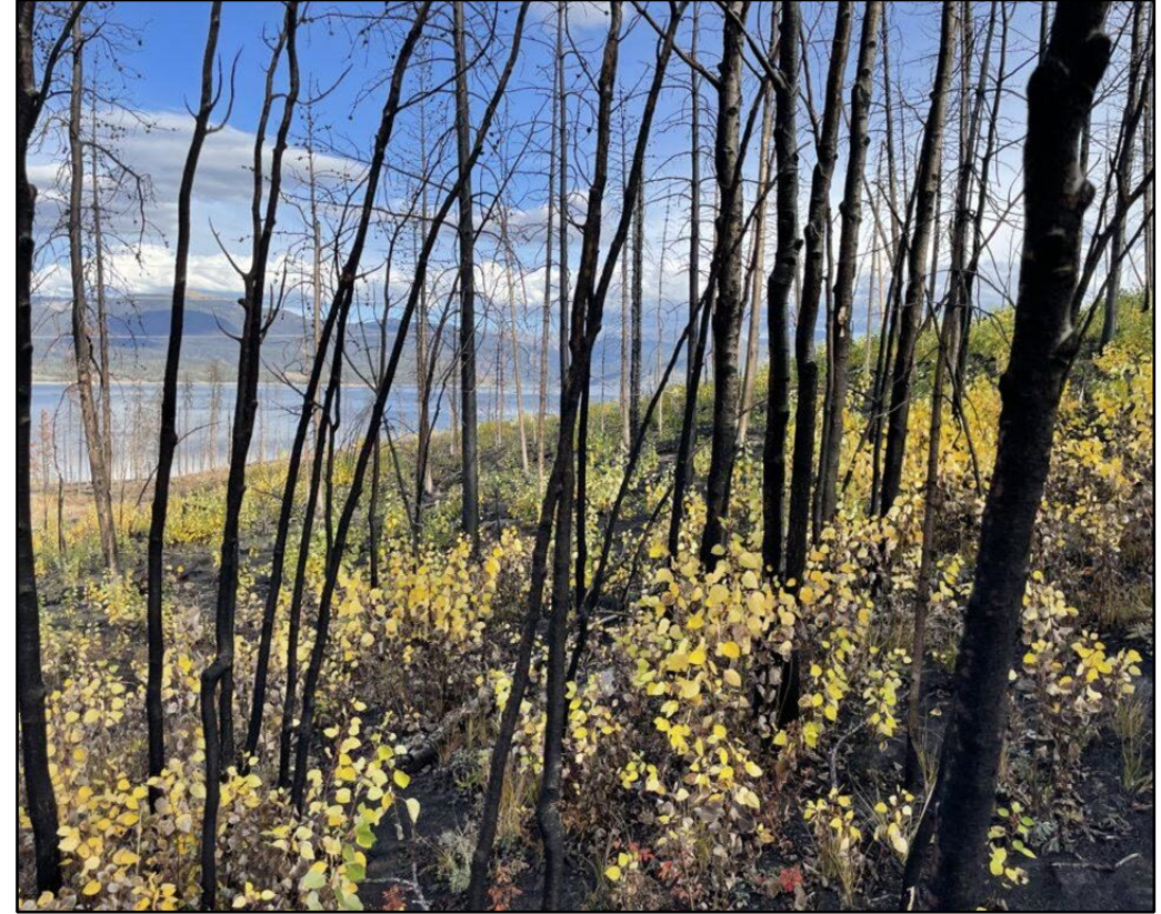
E. Troublesome Fire, approx. one year post-fire (10/7/202