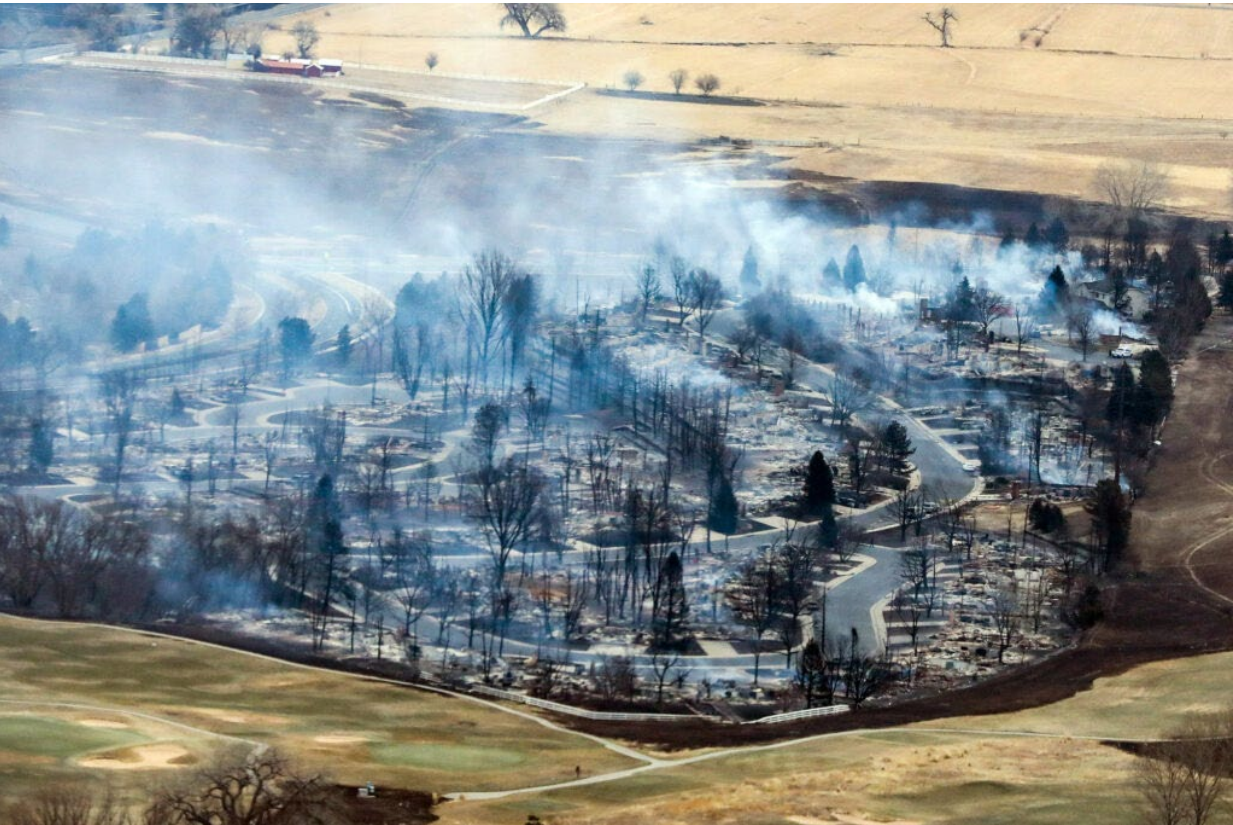
2020 Colorado Wildfires August 2020 Creator: NASA via satellite