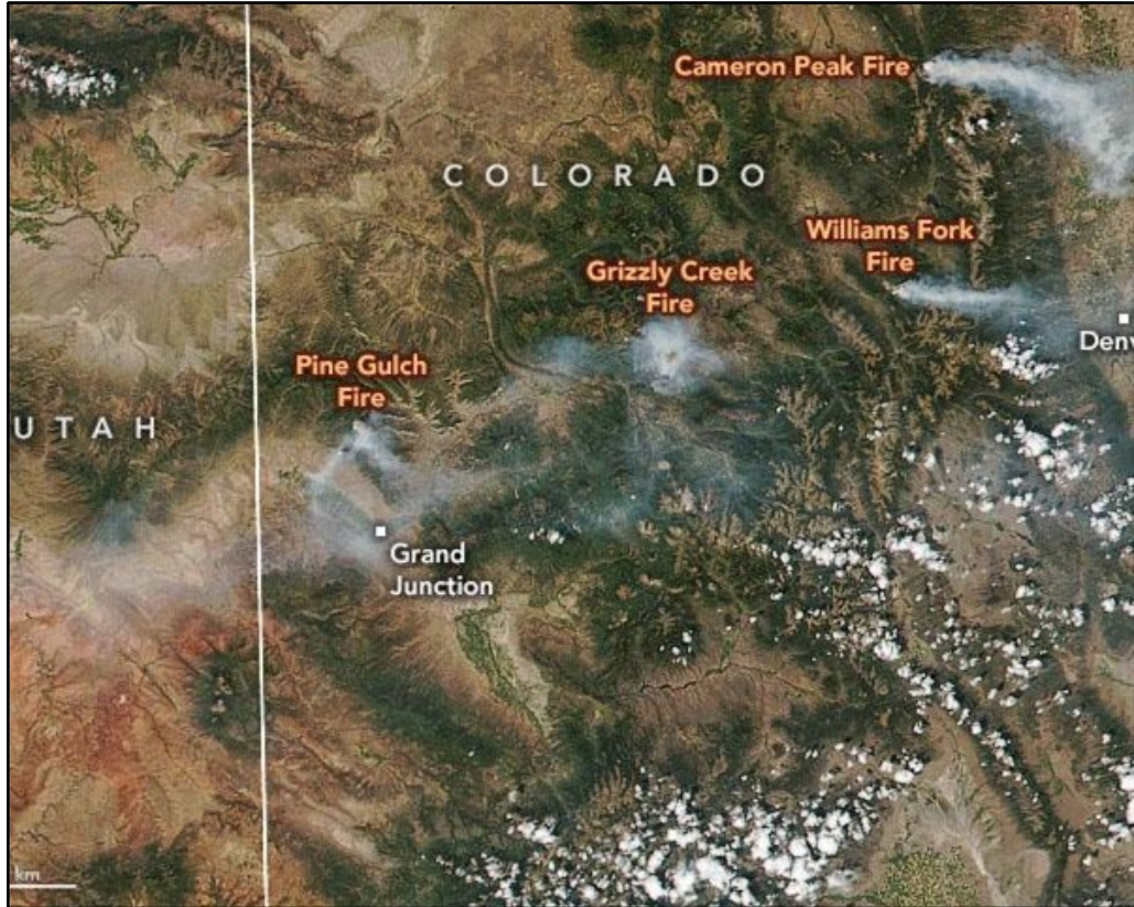
2020 Colorado Wildfires August 2020