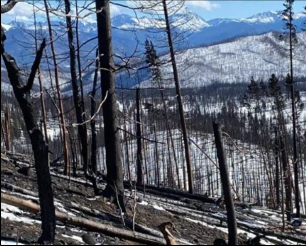
Cameron Peak Fire