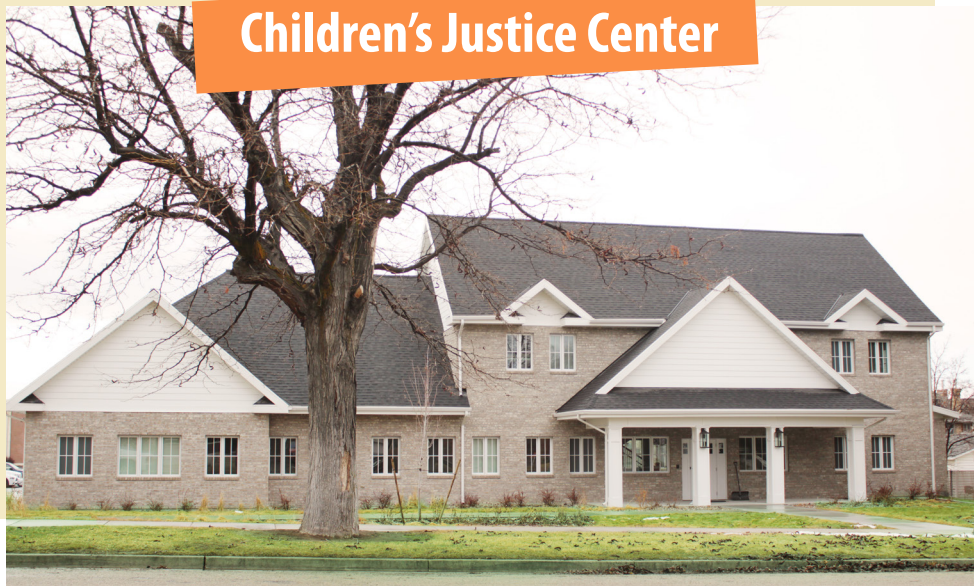
The Children's Justice Center in Tooele, Utah

Equal Opportunity Employer/Program • Auxiliary aids and services are available upon request to individuals with disabilities by calling 801-526-9240. Individuals who are deaf, hard of hearing, or have speech impairments may call Relay Utah by dialing 711. Spanish Relay Utah: 1-888-346-3162.